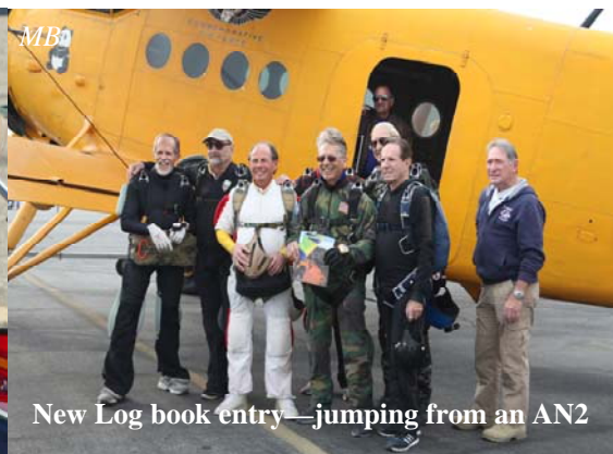
New Log book entry—jumping from an AN2