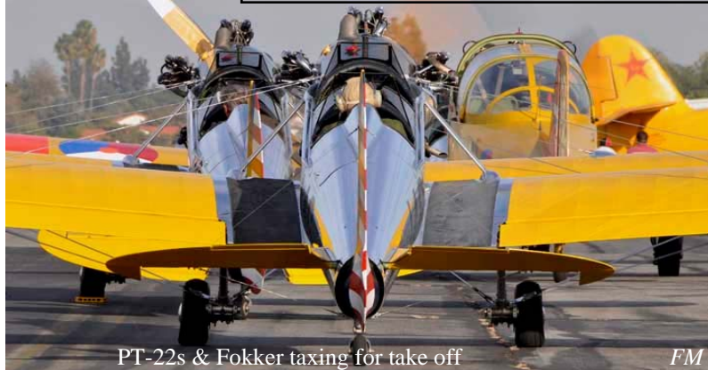
PT-22s & Fokker taxiing for take off