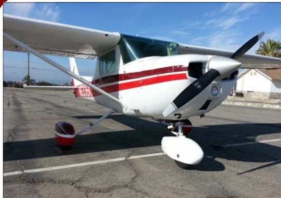
N6336K Cessna 150M Commuter New Aircraft On The Flight Line! $93/Hr Wet

Cable Aircraft Company Inc DbA Foothill Flying Club 1749 W. 13th Street Cable Airport Upland, CA 91786 (909) 917-5851