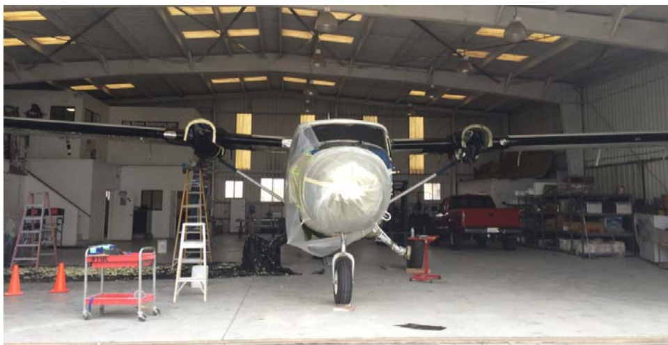
This is a site we Cableites have not seen for a long while.....a 'big' plane being stripped and then to be painted in the future in the "old paint shop" This is the Twin Otter from Mexico currently being serviced at Foothill Aircraft.