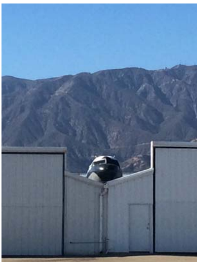
DC3 nose looking over hangars