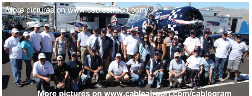
More pictures on www.cableairport.com