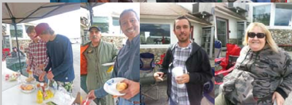
35 Members Attend the Flying Club Family BBQ Saturday November 23, 2013