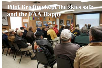
Pilot Briefing kept the skies safe and the FAA Happy