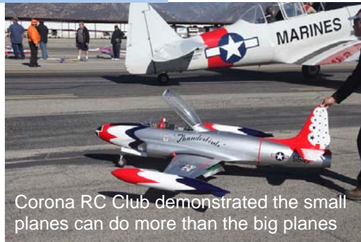
Corona RC Club demonstrated the small planes can do more than the big planes