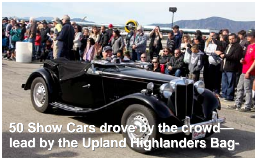
50 Show Cars drove by the crowd—lead by the Upland Highlanders Bag-