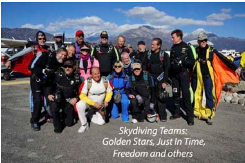
Skydiving Teams: Golden Stars, Just In Time, Freedom and others