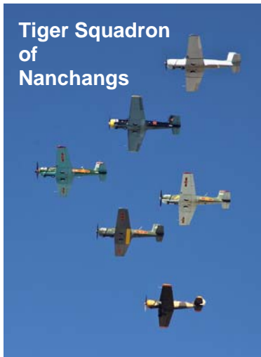
Tiger Squadron of Nanchangs