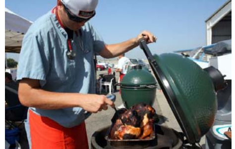
Hundreds showed up at the EggFest at Cable Airport. If it is good for the airport, it is good for aviation! And..... It is good for the pilot! Yum.....