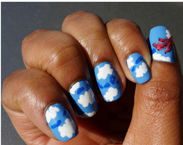
Danielle Reynolds likes to dress up in "Theme". You need to see this in color on the Cable WEB